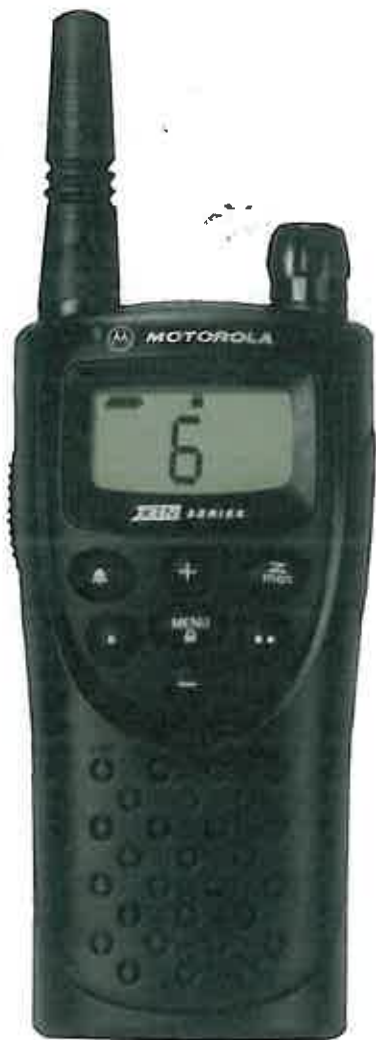
XTN Series Business Two-Way Radio