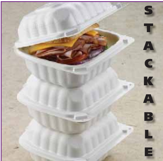
S T A C K A B L E