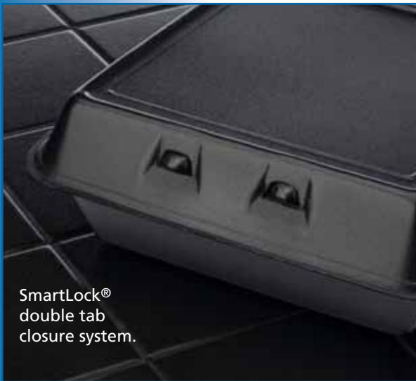
SmartLock® double tab closure system.