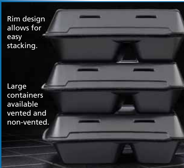
Rim design allows for easy stacking.