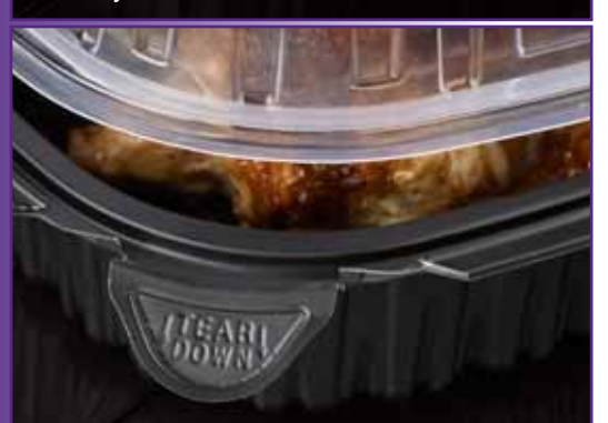
Tamper Evident seal must be torn down in order to remove the dome from the base.

Tamper evident seal attaches securely to the dome.